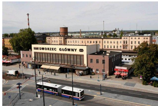
Bydgoszcz Train Station