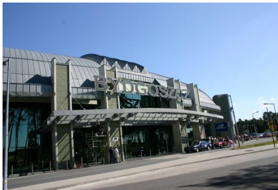
Bydgoszcz Ignacy Jan Paderewski Airport

http://rozklad.sitkol.pl/bin/query.exe/en - INFORMATION